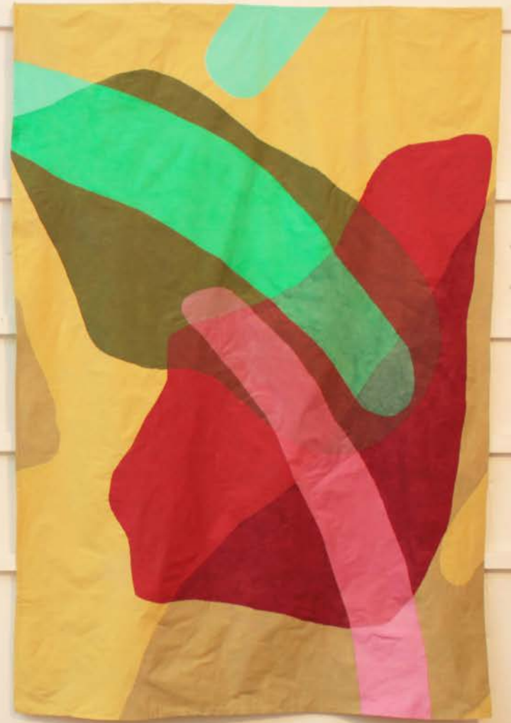
Loving what's left Gouache on fabric collage, 200 x 149 cm, 2021, £1,950