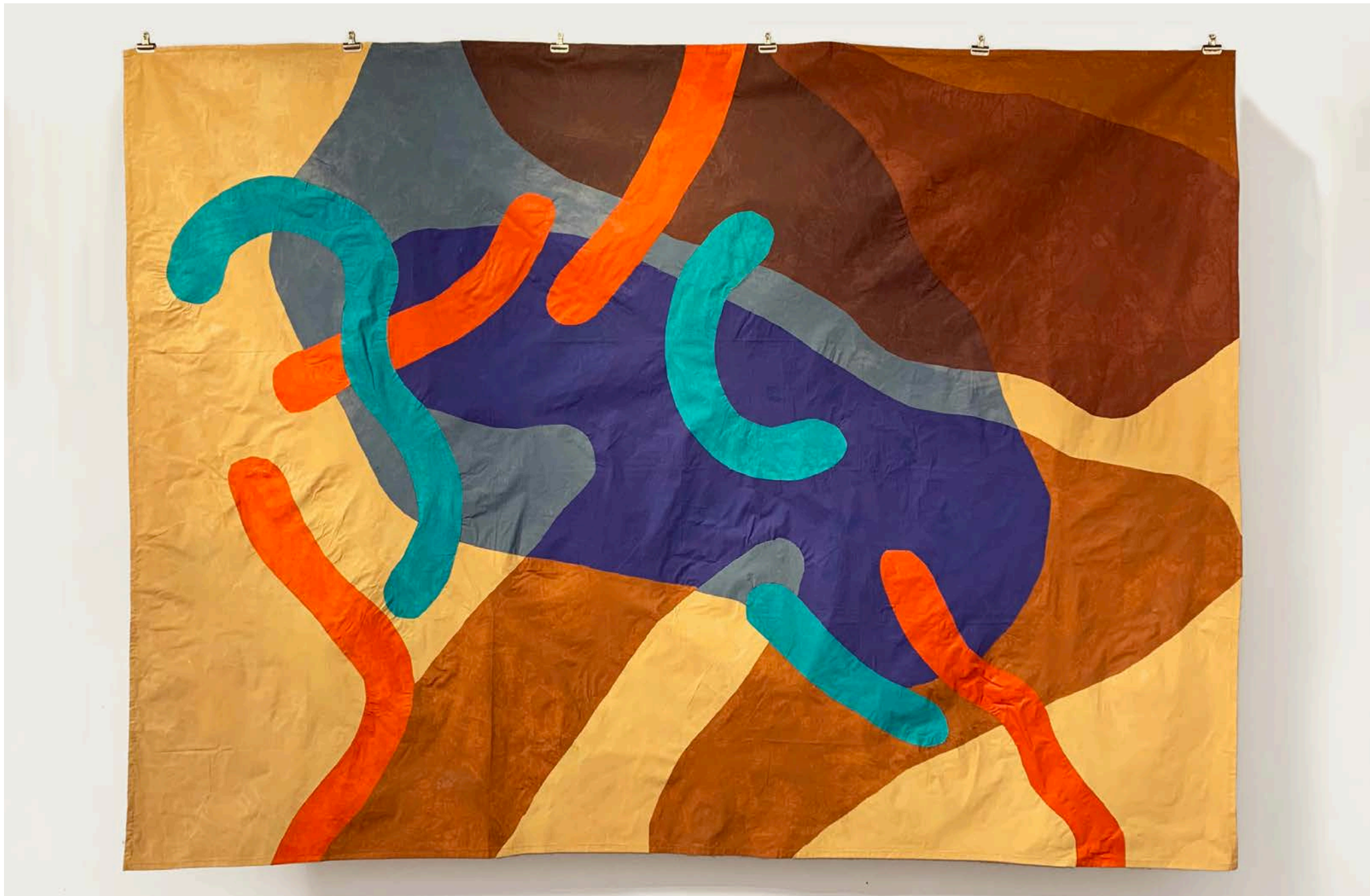
Slipped through the cracks

Gouache on fabric collage, 149 x 200 cm, 2021, £1,950