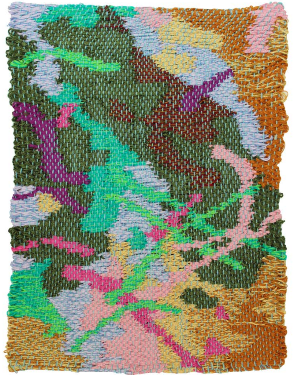
Eyes in my feet Woven cotton and linen, 28.5 x 21.5 cm, 2021, £750 (framed)